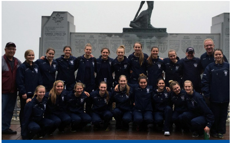
SMA Flames Prep team at the Terry Fox Statue in Thunder Bay, Ontario September 26 , 2015